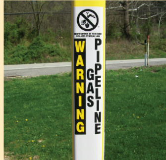
State law requires you have a SMUD representative stand by when digging within 10 feet on either side of our high-pressure natural gas pipelines.

It's critical to be aware of gas transmission pipelines in the vicinity of your job site.